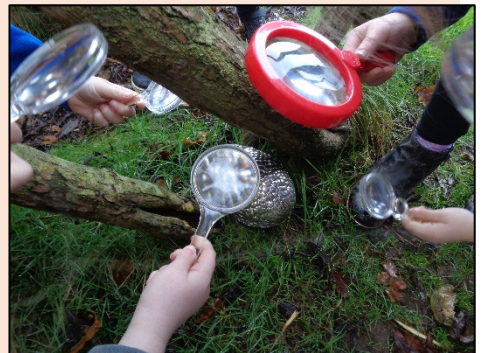
Class 2 find evidence of dragons! They then made inferences and asked questions about what they had found