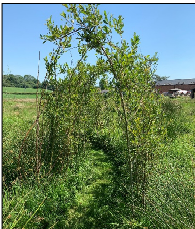
Willow tunnel at Bradley Barns

Bradley Barns Nursery have an exceptionally good relationship with Tushingham School, and we are seeking to run an after-school club there. To help make this happen we are seeking two enthusiastic, qualified individuals to help run the after-school club. The position will be from 3–6 pm Monday to Friday, term-time only. If you are interested or know anyone who may be, please call the Nursery on 01948 838321.