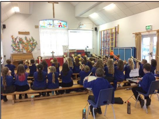
Class 4 learning to play brass instruments in their music lesson