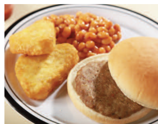
Sausage Pattie in a Bun, Hash Browns and Baked Beans