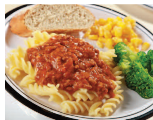
Pasta Bolognese served with Garlic & Herb Bread and Seasonal Vegetables