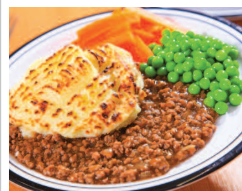
Cottage Pie served with Seasonal Vegetables