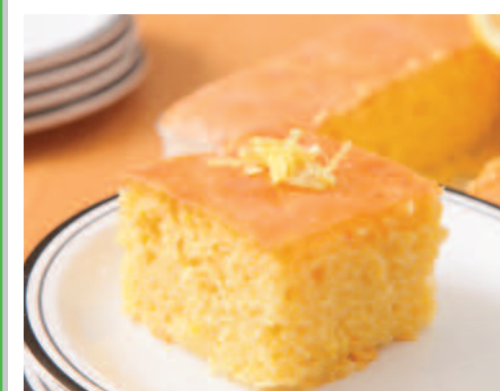
Lemon Drizzle Cake