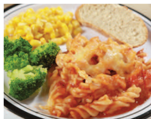
Cheese & Tomato Pasta served with Garlic & Herb Bread and Seasonal Vegetables