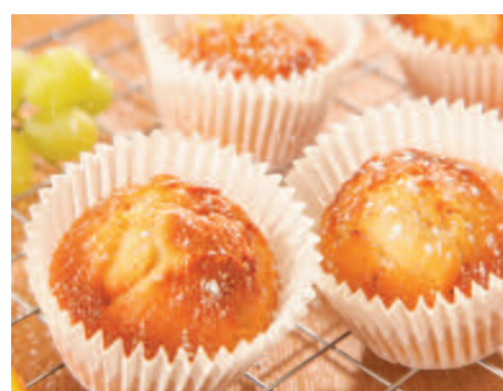
Apple & Cinnamon Muffin