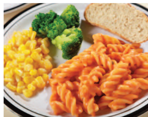
Tomato & Mascarpone Cheese Pasta served with Garlic & Herb Bread and Seasonal Vegetables